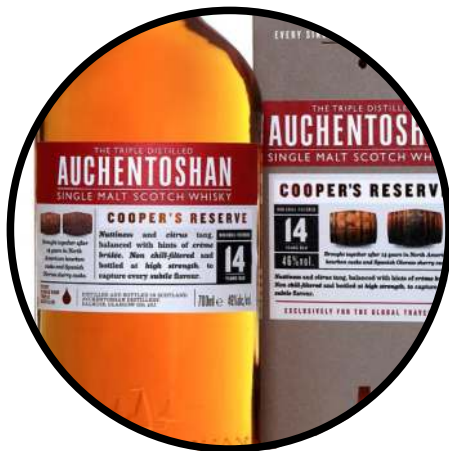
AUCHENTOSHAN COPPER RESERVE