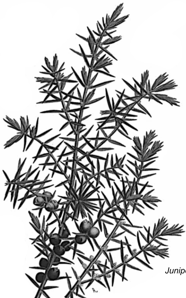
Juniperus communis L.