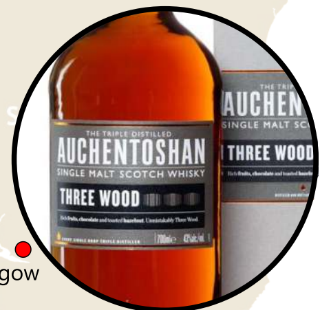
AUCHENTOSHAN THREE WOOD