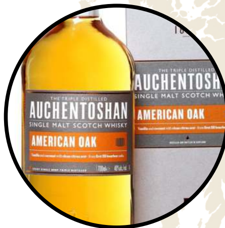
AUCHENTOSHAN AMERICAN OAK